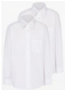
White Shirt Long or Short Sleeved