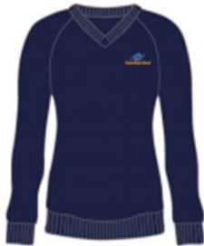
Jumper embroidered with same crest for all year groups