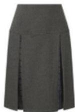
School grey skirt with navy insert. (The only acceptable skirt for the new uniform)