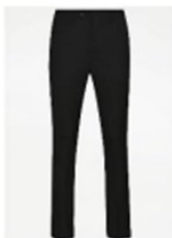
School Grey trousers (No skinny fit/leggings/jeans/joggers)