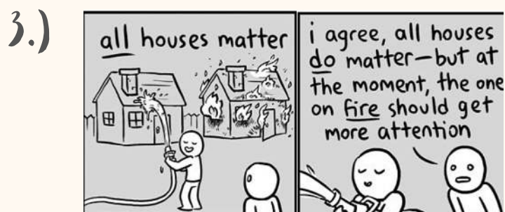
illustration credit: Kris Straub